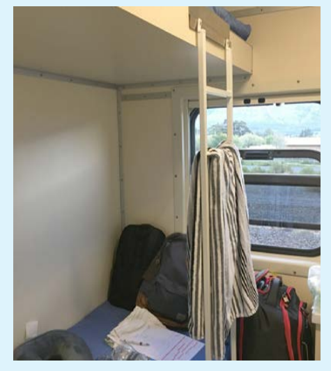
Living guarters on the train were compact.