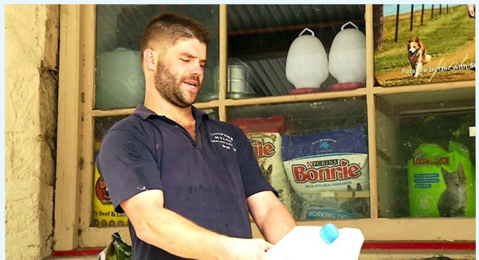
A still image from the video developed for GP practices by Optometry South Australia.

The resources include a five minute video for practice staff which explains what an optometrist does and, a call to action for the community 'Eye Health Champion'. The pack also includes