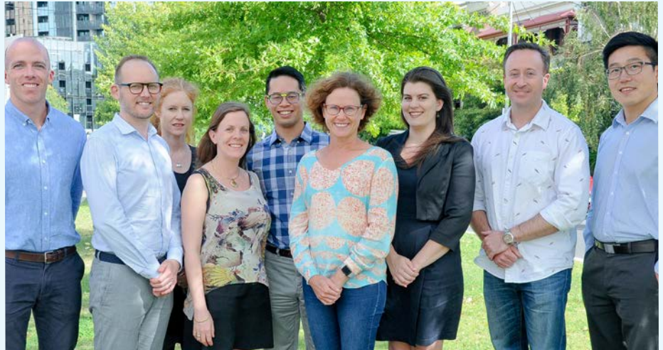
The new Optometry Victoria South Australia Board will commence work from 1 July, 2019.

Across the last financial year we have worked hard across both states, to deliver face-to-face CPD seminars and conferences, to support early career practitioners, to raise awareness with families of the benefits of regular optometric care for children and, to