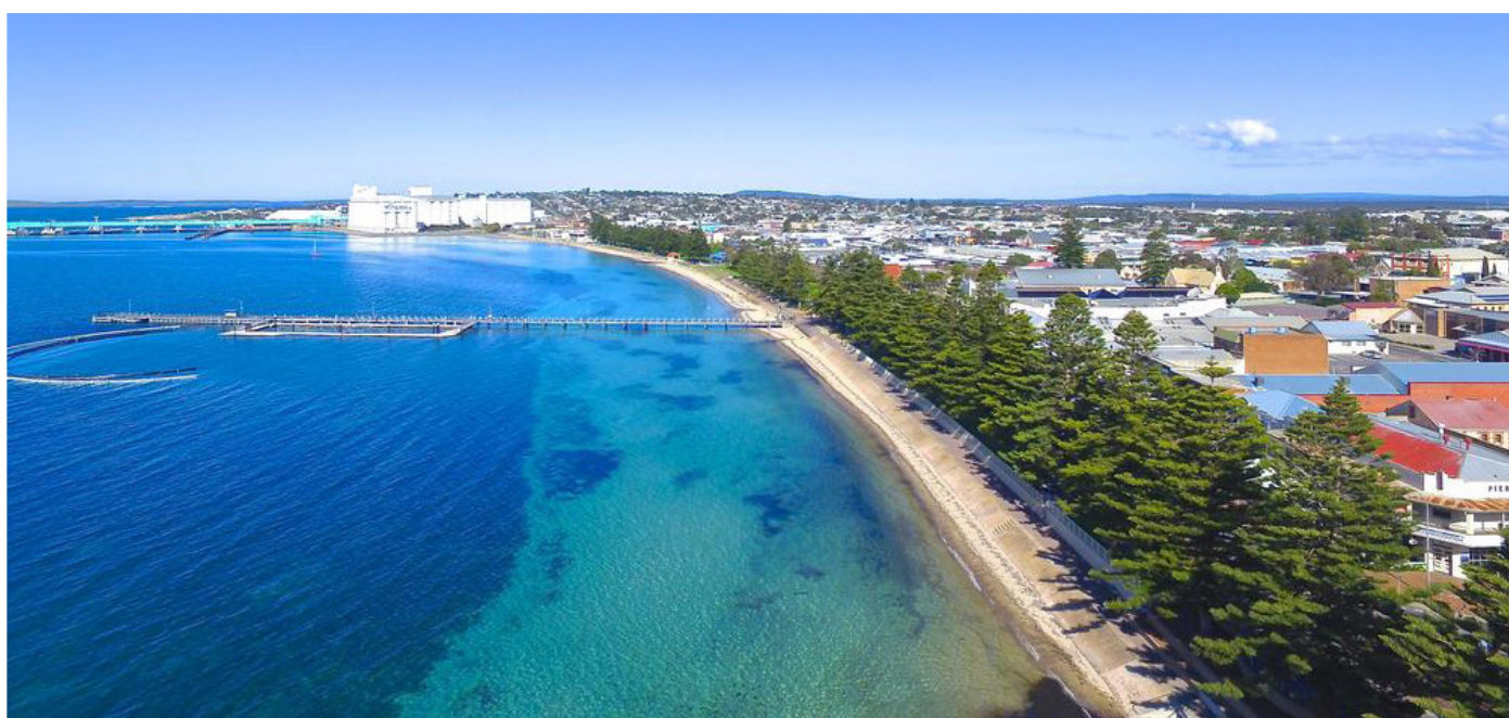
An aerial view of Port Lincoln, South Australia