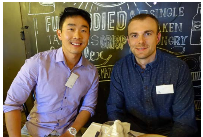
The seminar was popular with members in Adelaide