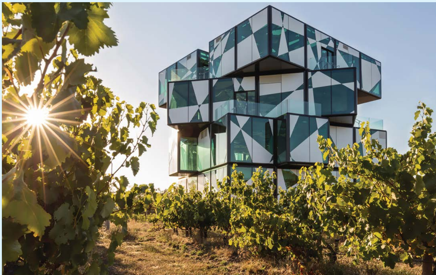
The d'Arenberg Cube in McLaren Vale is one of the venues for the next OV/SA rural and regional CPD seminars. This seminar will also offer members the chance to meet the OV/SA Board Directors.

Venue: Mildura Grand Hotel, Seventh Street, Mildura