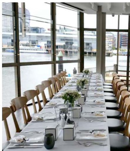
Berth restaurant in Melbourne.

OV/SA's senior staff, a Board Director and Early Career Optometrists Victoria South Australia (ECOV/SA) committee members will also be there to chat with members and talk about issues of interest.