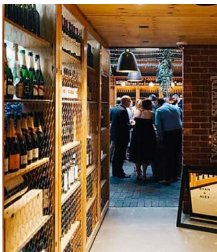
The Kentish Hotel in Adelaide

Free dinners are being held in Adelaide and Melbourne in April for Immediate Graduate members.