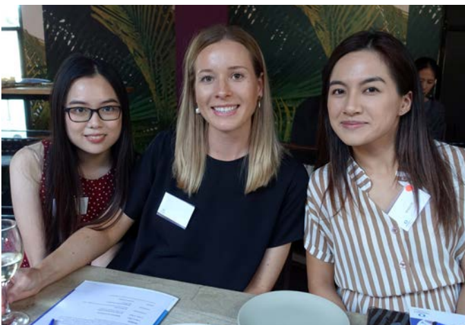
Members enjoying the seminar in Melbourne

To view more photos from the two events visit www.optometry.org.au/cpd-publications-events/cpd-event-calendar and click on the events in the calendar