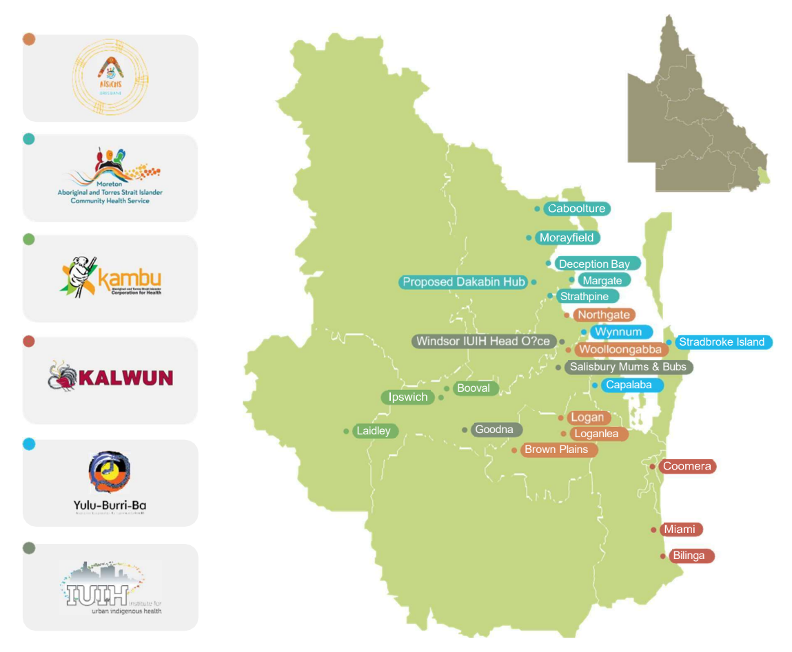
Please note: The Institute for Urban Indigenous Health operates in an urban setting in South East Queensland. The eye health team does not provide experience or exposure to rural and remote Aboriginal and Torres Strait Islander health.

The successful applicant will be provided with a student placement experience (minimum 4 weeks), a travel and accommodation support package, and the opportunity to attend relevant Australian conferences with financial support.